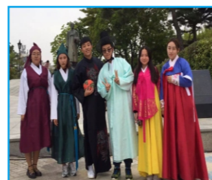
Exchanging Students in Korea

School of International Education(SIE) was established in 2008. It serves for students to further their study overseas; international students' enrollment, teaching and daily management; teaching and research cooperation with overseas universities, and staff training overseas.