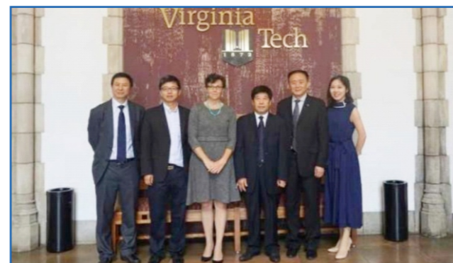
Visiting Virginia Tech

WUT ranked Second Prize three times in the ranking of international competitiveness of private universities in China. The university has established partnerships with more than 50 universities from more than 20 countries, and has enrolled 300 international students from more than 20 countries. At the same time, WUT have set up overseas campuses in Osaka of Japan, Paris of France and Bangkok of Thailand. Besides, Sino-Canada School has been established in cooperation with Niagara College in Canada, and the Sino-Korea school has been established in cooperation with many high-level universities in South Korea. WUT provides great platforms for students to seek further study, paid internship, study tour, and employment overseas. In recent years, the university has provided more than 1000 students with the opportunity to study and exchange in the United States, Canada, France, U.K., Japan, South Korea, Singapore and other countries.