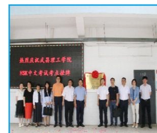
Opening Ceremony- HSK Center

There are English-taught undergraduate programs such as Business Administration, International Economics and Trade, Computer Science and Technology, and Civil Engineering and etc. At present, there are more than 200 undergraduate international students on campus. In order to strengthen Chinese language education internationally, a national Chinese Language Proficiency Test (HSK) center has been set up and national Chinese language test and training can be taken.