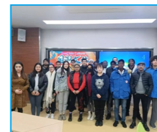
Chinese Language Class