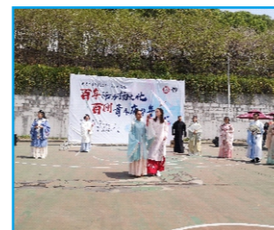
Traditional Han Clothing Show