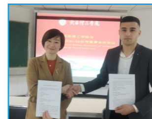
Cooperation with Successful Alumni

The university has cultivated a group of more than 200 international talents with solid professional foundation and "knowledge, friendship and love of China". Excellent alumni continue to emerge, 70% of the alumni choose to continue their Master's Degree, some of them have grown to become senior technical experts in local famous Chinese enterprises, and many of the alumni have founded overseas study service companies after returning to China. The Academy has also established alumni associations in Kazakhstan, Turkmenistan, the Russian Federation and other countries.