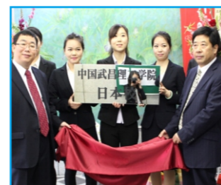
Opening Ceremony-Osaka Campus