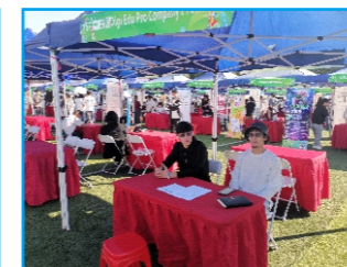
Campus Job Fair