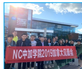
Visiting Students in Canada