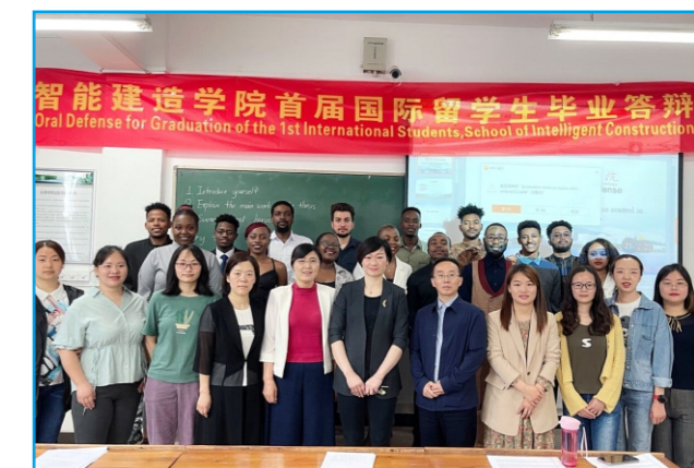
Graduates Thesis Defense