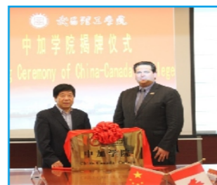
Opening Ceremony- Sino-Canada School